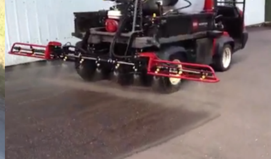
Computer-Controlled Spray Rates